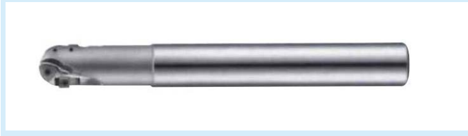
2239 全R粗銑刀 Full ball nose coarse end mill