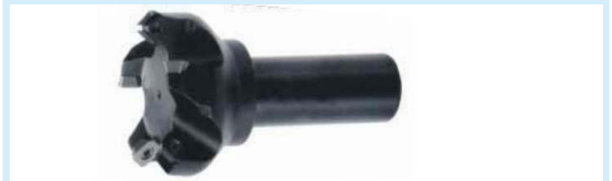
SE445 直柄平面銑刀 Straight shank face milling cutter