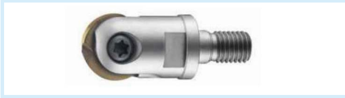
2139 連接式精修球刀 Connection type fine cutting ball nose cutting