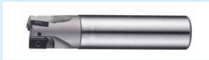
AP 直柄直角銑刀 Straight shank shoulder cutting Milling cutter