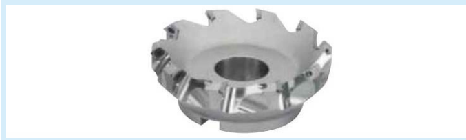
SE445 45°平面銑刀 45°Face milling cutter