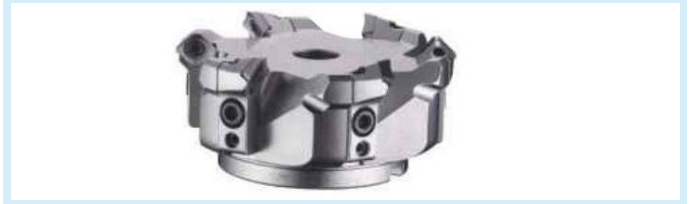
AKM 45°鋁合金刀盤 45°Aluminum alloy cutter