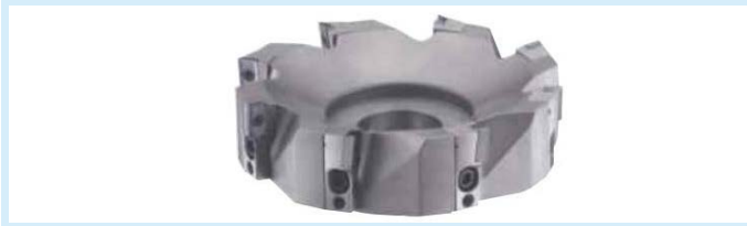
AAP 直角鋁合金刀盤 Shoulder cutting Aluminum Alloy cutter